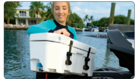
Swim Platform with Integrated LinQ System Exclusive quick-attach system on the largest swim platform in its category that allows for easy installation of accessories.