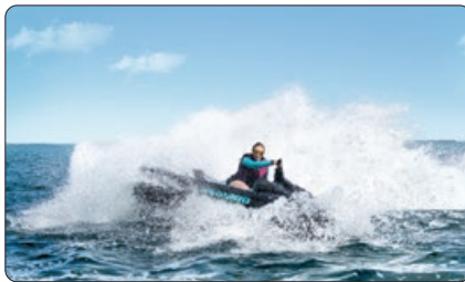
VTS (Variable Trim System) Provides handlebar-activated settings so riders can easily find the ideal trim for varying conditions.