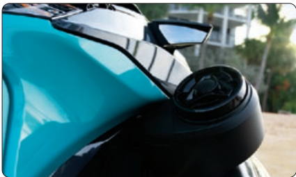
BRP Audio - Premium System (optional) A factory-installed, truly waterproof Bluetooth® audio system for an extra dose of fun and entertainment on the water.