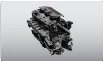
Rotax 1630 ACE - 230 Engine This powerful engine comes standard with a supercharger and external intercooler. It is optimized to run on regular fuel, which lowers fuel costs.