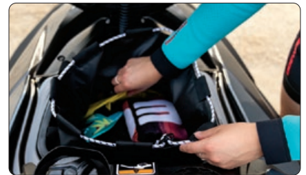
Large Front Storage An impressive 38 gallons of sealed storage space allows riders to safely stow belongings while riding. 1